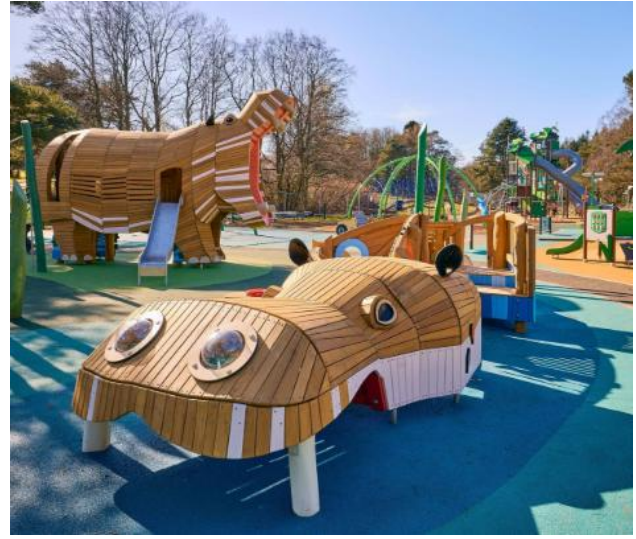
Fig 9: Hippo Play Area at New Adventure Playground in Riverside Park [photograph]. (Kompan, 2025)

The choice of a hippo as the center of this new play area, over 55 years after Bonnar/Harding's initial creations, is a true testament to the impact these works have had on the Glenrothes community. This feels like a full circle moment for Harding's work, not only is it getting the younger generation involved in the new history of Glenrothes, but it is connecting back to some of Harding's initial core values. Harding's artworks were things people could enjoy and interact with, they became play areas for local children and spaces to meet and interact with others, and this new park is a modern reincarnation of those visions and ideals.