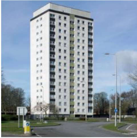
Fig 1: Raeburn Heights , Wimpey, 1967, Glenrothes, Scotland. Image: Peter Atkinson, 2017.

style of the 1950s and 1960s characterized by simple block-like forms and raw concrete construction' (Tate, 2025).