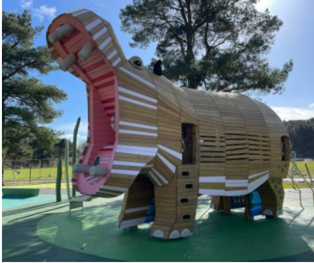
Fig 8: New Adventure Playground in Riverside Park [photograph]. (Fife Council, 2025)