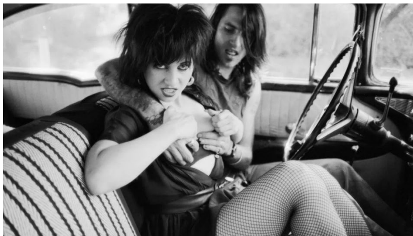
Fig 2.1 – Lydia Lunch and Marty Nations in Fingered (1986)

"Although it is not our sole intention to shock, insult or irritate, you have been warned that we are catering only to our own preference as members of the sexual minority."