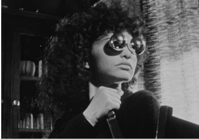
Fig 1.1 – Deren in Meshes of the Afternoon (1943)

proposed to have been a comfort for her living in New York and separated from her Ukrainian roots. This was an exhilarating new language in the same manner as her discovery of moving image. This sense of exhilaration is baked into Meshes of the Afternoon's onscreen world of wondrous and frightening edits and startling images, such as Deren appearing with glasses made from chrome orbs and her dreamlike