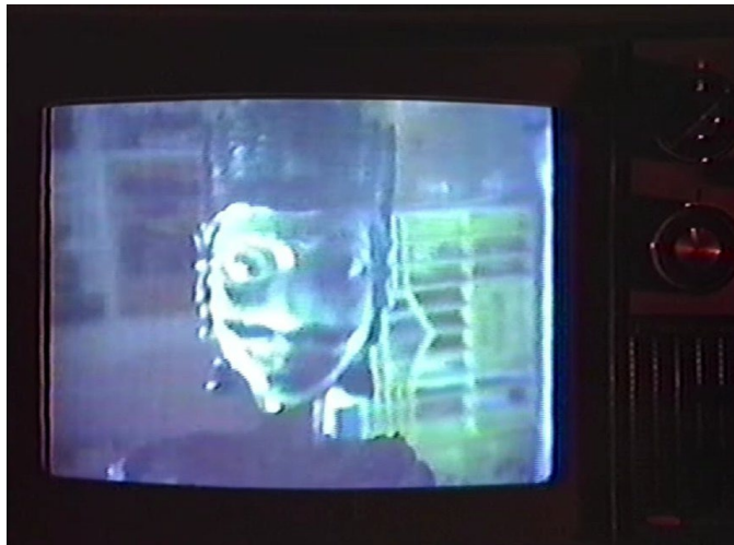
Fig 3.1 – Still from Twisted Issues (1988)

his own manifesto in the vein of Nick Zedd a decade before him. In this he castigates the corporate funding structures of contemporary Hollywood that still linger today and champions the concept of the filmmaker answering, “to no-one but themselves”. This I believe is the great strength of the use of accessible mediums in film, as it allows an