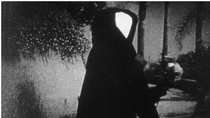
Fig 1.2 – The mirror-faced figure from Meshes

The film begins with a mannequin arm lowering from the sky to place a flower on the ground, suggesting a larger miraculous force at play guiding the events of the film. Deren, playing an anonymous woman, walks by and picks it up before taking it to her home, dropping her key on the way inside. The closeness with which we view the flower and key being interacted with, along with multiple point-of-view shots heighten the sense of a subjective personal experience that Deren so wanted to convey. Small moments such as dropping a key, a knife falling out of a loaf of bread, or the feeling that someone has been in your room before you echo out of reality and into a dream, becoming now fantastical talismanic events. In sleep, these events coalesce, as doppelgangers of the woman repeat the same action. A cloaked figure with a mirror for a face is eventually seen, seemingly transforming into another double. It leans in with the knife before