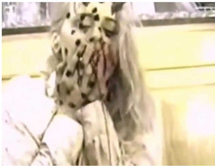
Fig 3.3 - Still from Busted Babies (2024)